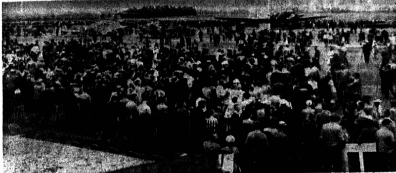
Four Lancaster bombers are seen flying in formation over the Charlottetown Airport Saturday when the Centennial Aviation show was held. Below a portion of the large crowd that attended the show are seen as they looked over the many types of aircraft on display.