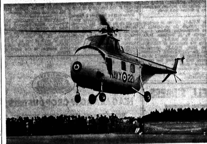
Helicopter Shows Off Manoeuverability One of the many aircraft that thrilled the crowd at Saturday's Centennial Aviation Show was the Sikorsky S-55 helicopter, which displayed to the huge crowd the capabilities of this Royal Canadian Navy aircraft.

By Sidney Welland MOSCOW (Reuters) — A new jet transport plane, a huge twin-engine helicopter and two new types of jet fighters were shown Sunday as Russia paraded her might of the jet era in the annual air display at Tushino airport near Moscow. Western observers, noting the appearance of many intercontinental turbo-prop and jet multi-engine bombers, said this indicates a rapid development in Soviet long-range striking power. Russia's air chief marshal, P. F. Zhigarev, opened the display and said the Soviet Union has first-class modern aircraft capable of flying long distances at high speeds and in unfavorable weather conditions. The display was capped by a surprise flypast of Russia's new (Continued on page 2 col. 4)