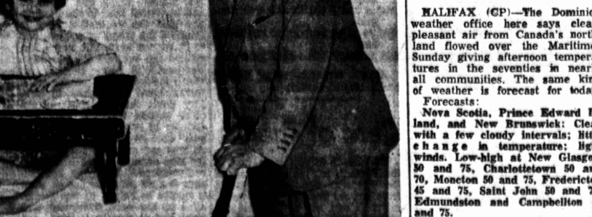
Foster Hewitt Says Hello To Sanatorium Patients Foster Hewitt is seen speaking to one of the many patients he visited at the Provincial Sanatorium on Saturday, prior to the Centennial Airshow. Mr. Hewitt spent several hours at the Sanatorium on Saturday morning and spoke to many of the patients there.

Foster Hewitt is seen speaking to one of the many patients he visited at the Provincial Sanatorium on Saturday, prior to the Centennial Airshow. Mr. Hewitt spent several hours at the Sanatorium on Saturday morning and spoke to many of the patients there.