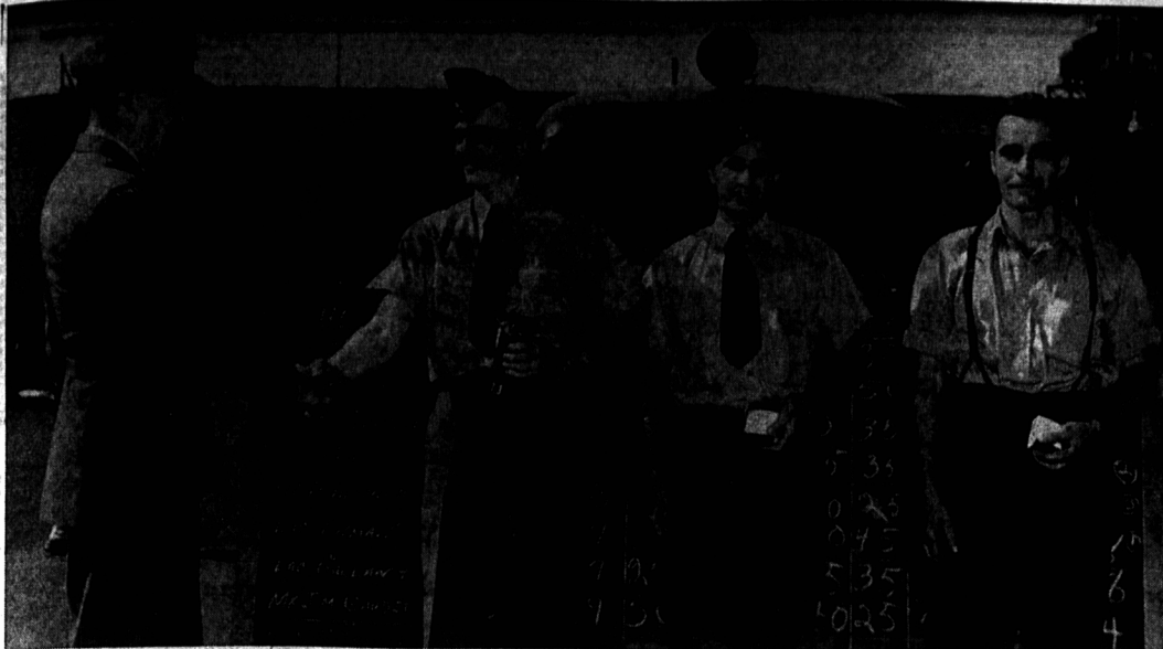
COMPETITION WAS KEEN in the events of the Air Force's Truck Rodeo held at the R.C.A.F. Station, Summerside, yesterday, and the winners were heartily congratulated on winning their events.