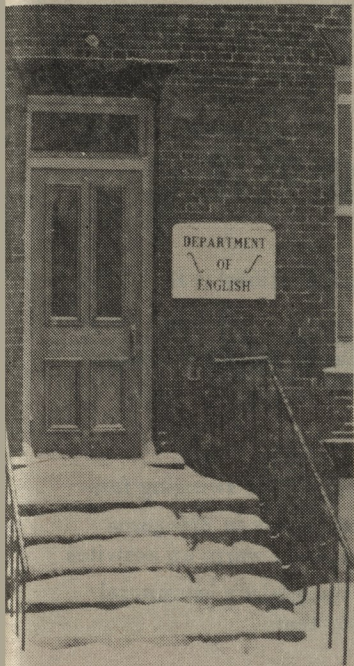
English Department steps covered in snow from Tuesdays storm.