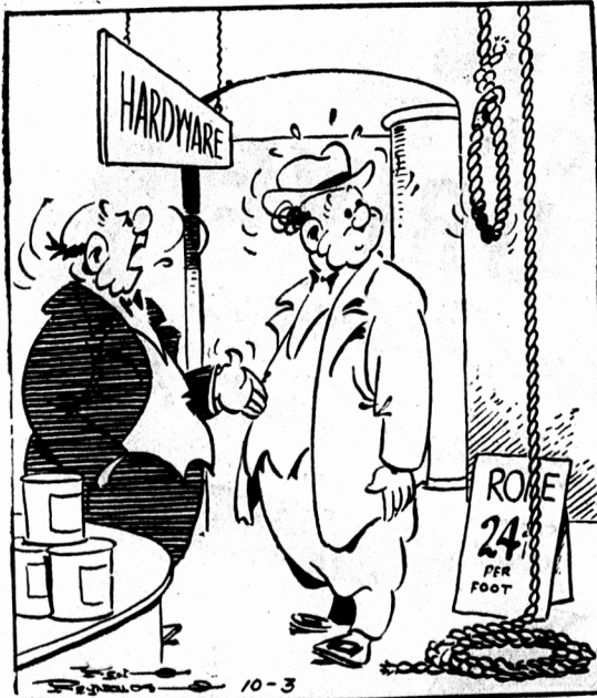
"Yes, that's the rope swing we advertised in the Guardian Want Ads—it's strong too!"