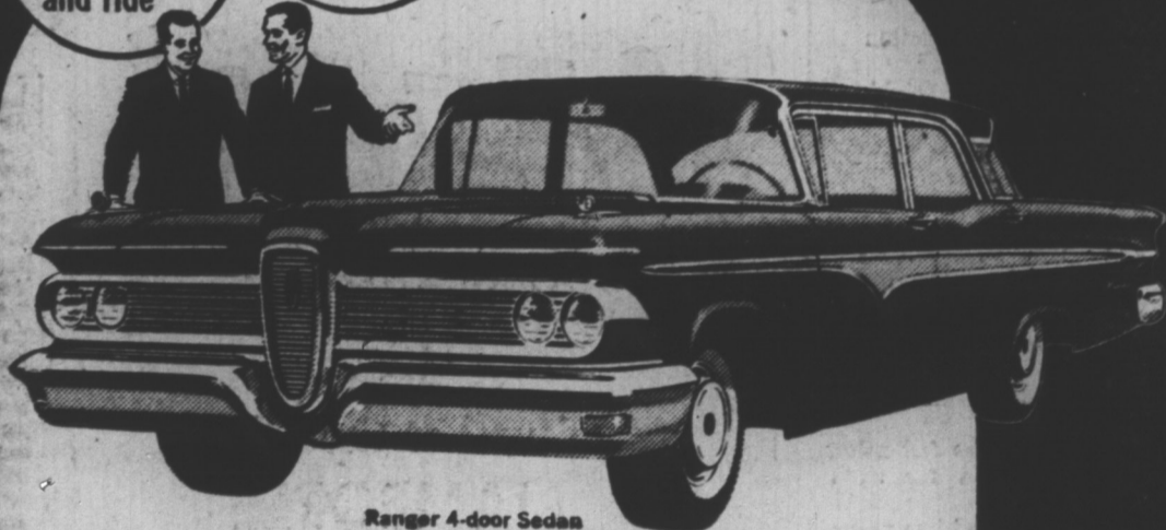
Ranger 4-door Sedan

Only Edsel gives you all these features at no extra cost: