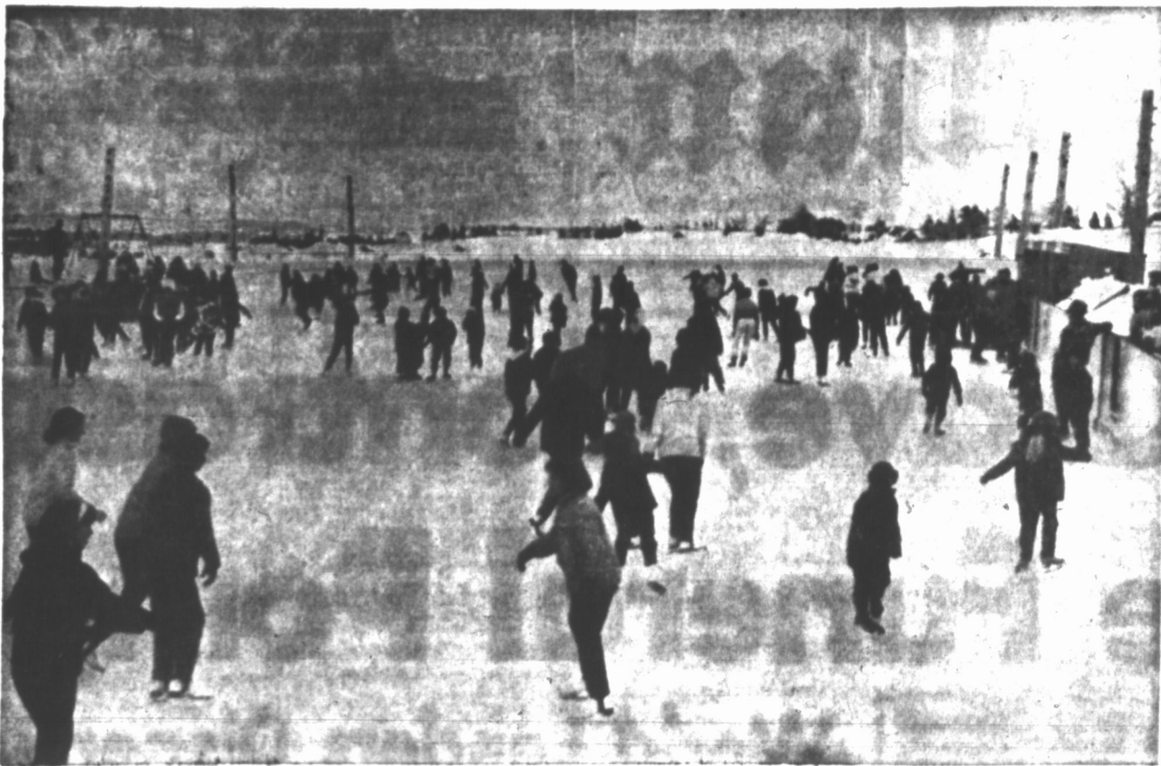
GIANT CROWD ENJOYS SHERWOOD RINK

Sherwood rink on Maple Avenue was a busy place yesterday recording at 550 the largest attendance of the season. The rink recently reopened after the January thaw that curtailed operations at most outdoor rinks. The 90 by 180 foot rink is in its fourth year of operation and is under the directorship of the Sherwood Recreation commission. It is financed by donations from the community and by a grant from the physical fitness branch of the department of education.