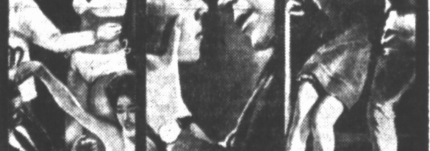
THE 'BABY PARTY'... that ended up in a wild wall-to-wall ball! THE BOY FROM THE SLUMS... who became a doctor and had to knife-fight for his girl! THE ATTACK... on the young doctor's girl by three hood!

THEY SAVE LIVES WITH A PASSION... AND MAKE LOVE WITH ABANDON!