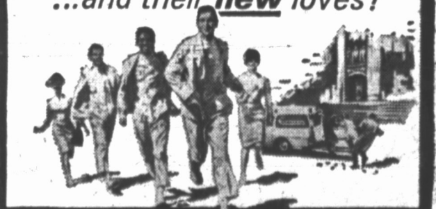
STARRING MICHAEL CALLAN - DEAN JONES - TELLY SAVALAS BARBARA EDEN - STEFANIE POWERS - KAY STEVENS and INGER STEVENS as NANCY - Introducing GEORGE SEGAL