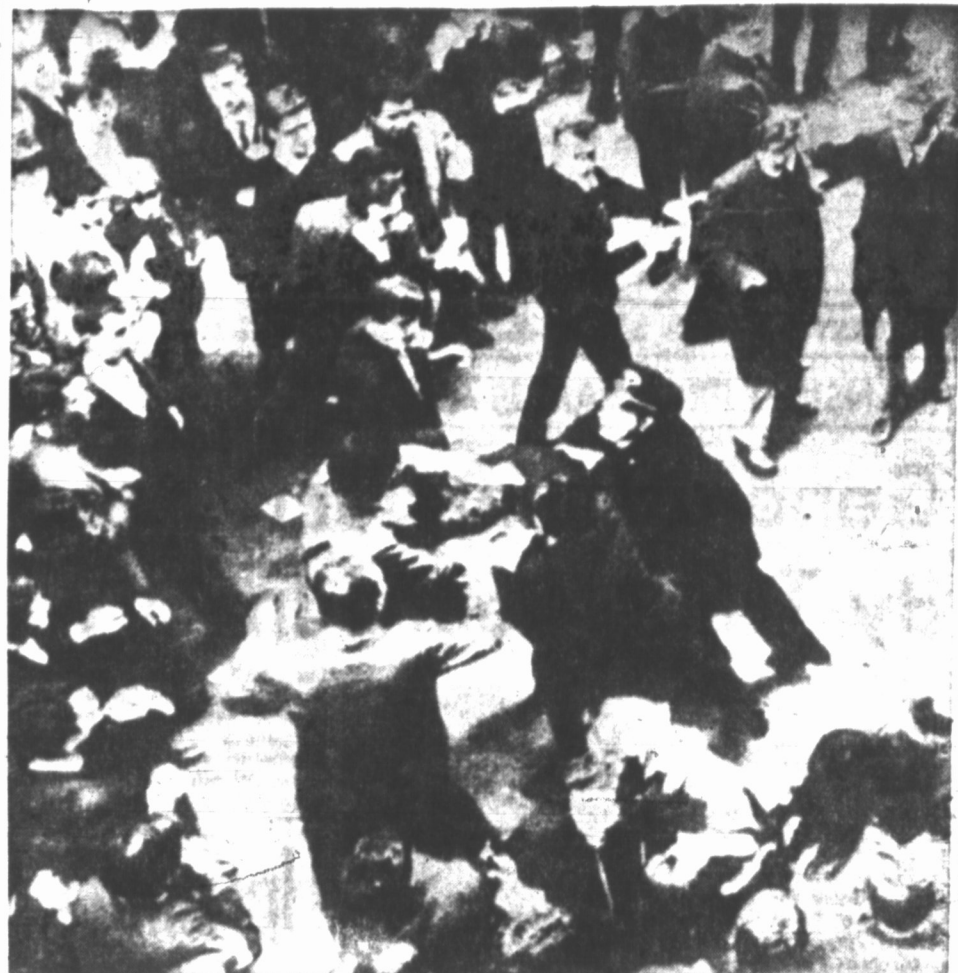
ROCK 'N' ROLLING IN ROME

The Queen and her party were driven to Buckingham Palace. There the Queen was hosted at a luncheon for visiting royalty, Commonwealth prime ministers and representatives of France, the Soviet Union and the United States. Pearson and Opposition