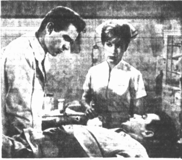
Michael Callan, one of 'The NEW Interns' at the Capitol Theatre, becomes an emergency room patient in this scene from the Columbia Pictures release. Dean Jones is the doctor and Barbara Eden the nurse. Other stars in the Robert Cohen production are Telly Savalas, Stefanie Powers, Kay Stevens, Inger Stevens as Nancy and newcomer George Segal. The New Interns opens today at the Capitol for a 3 day run.