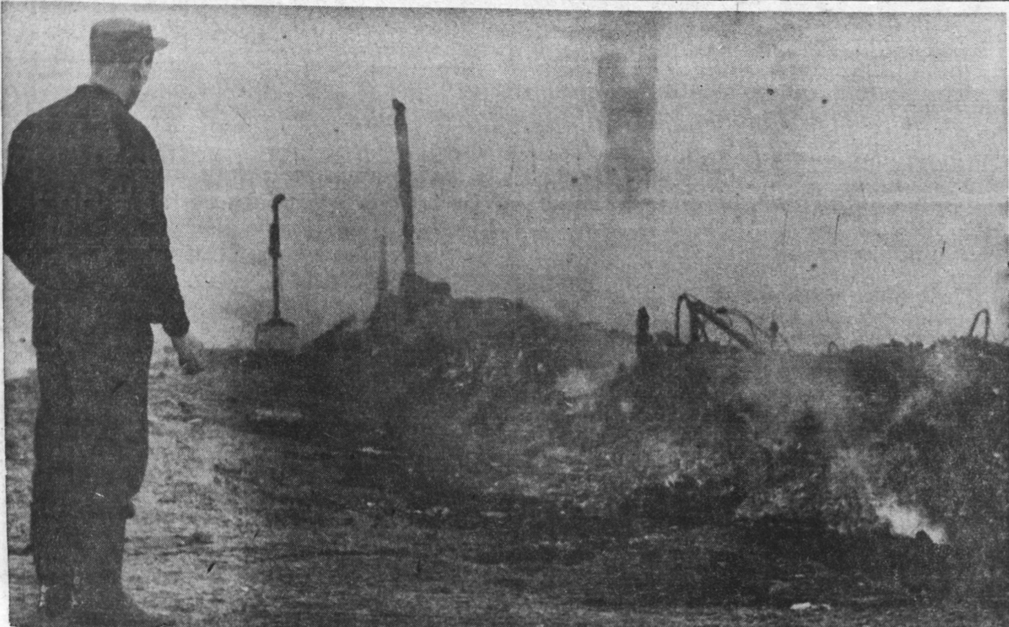
OWNER LOOKS DISCONSOLATELY AT RUINS OF HIS HOME

CHARLOTTETOWN, CANADA THURSDAY, JANUARY 10, 1957