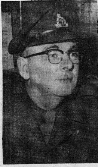
WO I PLACE