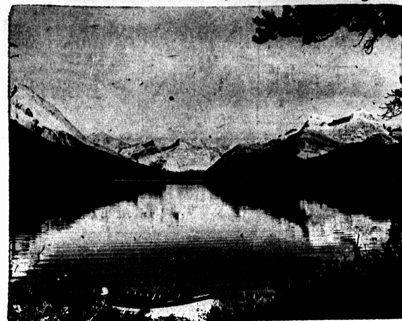
Sixteen peaks which encircle Queen Elizabeth range in honor of the Queen's coronation. The left to right: Mount Sampson, Maligne lake — the most photographed body of water in North America — in Jasper Park, Canadian Rockies, are now called the individual names. Seven of these peaks with their icefields and glaciers, shown in this picture, are named in honor of the Queen's coronation. The left to right: Mount Sampson, Maligne Mountain, Mount Paul, Mount Warren, Mount Mary Vaux, Mount Carlton and Mount Unwin.