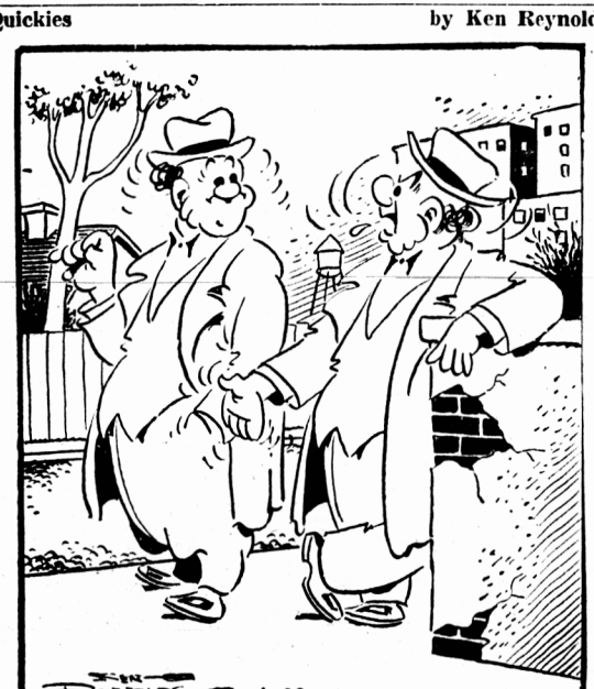
"I had to sell my car with a Guardian Want Ad—couldn't find parking space!"