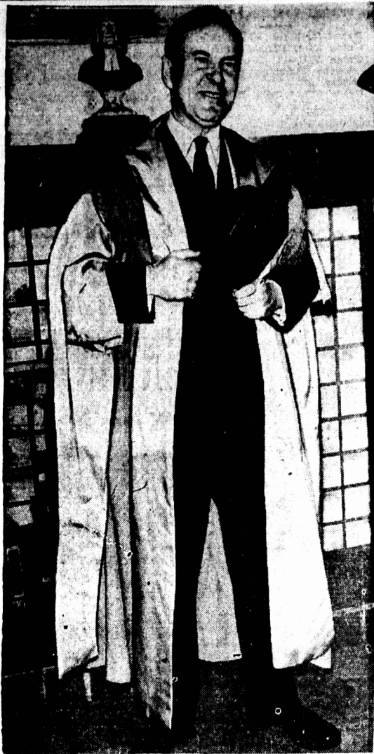
The traditional formal ceremony of installing a university chancellor were supplanted by noisy student fanfare when Canada's popular external minister, Hon. Lester B. Pearson, donned the scarlet and gold chancellor's robes of Victoria University, Toronto. However, Mr. Pearson, 1919