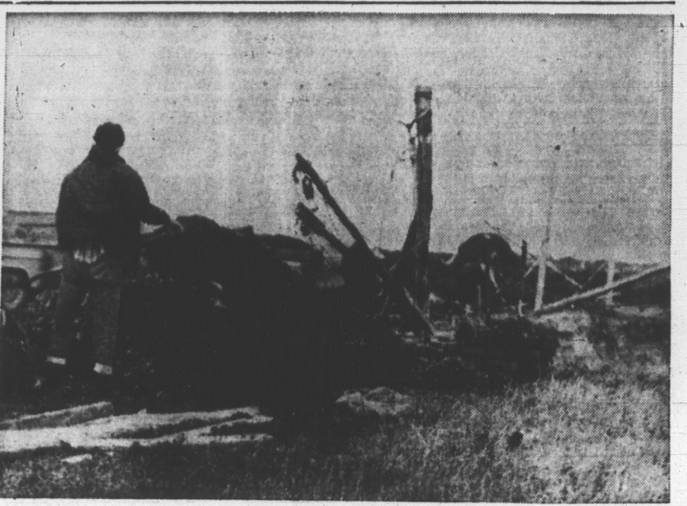
Tons of Irish moss thrown up on the shoreline at Norway on the west shore of the province about four miles from North Cape is being gathered in large quantities by farmers and fishermen in the Tignish area. The recent storm has thrown up the moss. The moss is exceptionally clean thus speeding the processing part of harvesting and marketing. The men are shown here piling and hauling the moss.