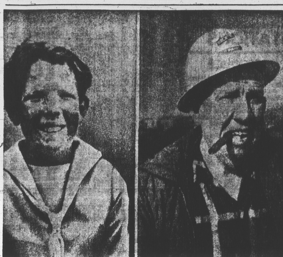
FRECKLES OF 1920S NOW IN TASMANIA