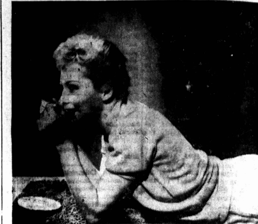
TEENS 'N' TWENTIES TAKE TO TEA—A cup of Tea works wonders when they're tired and it's so relaxing.

the shoes should match the suit, not the hat." A kind word was spoken for the brown bowler by another correspondent and many Englishmen were astonished to learn that a derby can be brown. Brown bowler and brown shoes seems to be a combination which is granted modified approval.