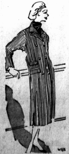
By VERA WINSTON COVER-ALL

The variety of coats offered for our spring selection is extremely wide, with something for every taste, type and pocketbook, the values outstanding. A delightful cover-all for commutator, vacation, traveler, career or college girl is a coat of cotton cord in black and white stripe and completely lined. The double-breasted coat is precision tailored, has white leather buttons and stripes above its flapped pockets. The fabric is light weight, just right for solid weather.