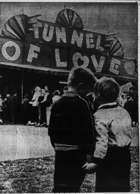
PICTURE WINS NATIONAL AWARD This photo of a little boy and girl standing hand-in-hand before the entrance to a fairground's Tunnel of Love won the feature photo prize in the 1961 National Newspaper Awards. It was taken by Jack Jarvie of the Braintree Express. (CP Photo)