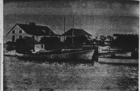
JUDE'S POINT—HOME OF TIGNISH FISHERIES

VEGETABLES AND OTHER PERISHABLE GOODS Vegetables and other perishable goods in order to bring top prices must arrive at their destination quickly and as fresh as possible. Your Telephone plays an important role in the quick despatch and delivery of these perishable goods. If speed is essential — use Long Distance.