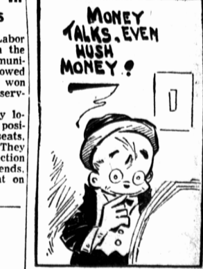
MONEY TALKS, EVEN MUSH MONEY?

Hundreds of people are returning to work all over the Province according to figures compiled at the Charlottetown National Employment Office. Many of these have been observed in the fishing industry and there is an increased demand for help with upsurge of employment in construction. However, say officials of the local office, the activity in construction has been delayed by poor weather and only now is beginning to gather momentum. The catch of lobsters in the Souris area has been very encouraging and the landings of had-dock have been good to date. Practically all of the fish plant workers in and near Souris have been given employment and there may be a shortage of help by early summer. In keeping with increasing employment opportunities, the number of people drawing unemployment insurance benefits will dip below the thousand mark this week end, to approximately one-third of the peak total reached in March.