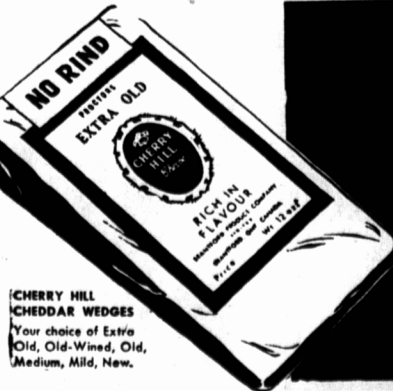
Enjoy the finest Cheddar you can buy!

BABY'S OWN TABLETS [MOTHERS: For largest supply and price, direct to you, write to BABY'S OWN TABLETS, 15, Ave. Central, Toronto, Ont.]