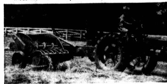
McCormick No. 45 Baler — available for pto or with separate engine.

In your race against the weather and high labor costs, you need your own McCormick No. 45 baler. Bales at up to 6 tons per hour. Features exclusive automatic bale density regulator as optional equipment. Choice of pto or engine drive models. Let us demonstrate a new, fast-baling McCormick No. 45 in your own hayfield now. It's "tops"!