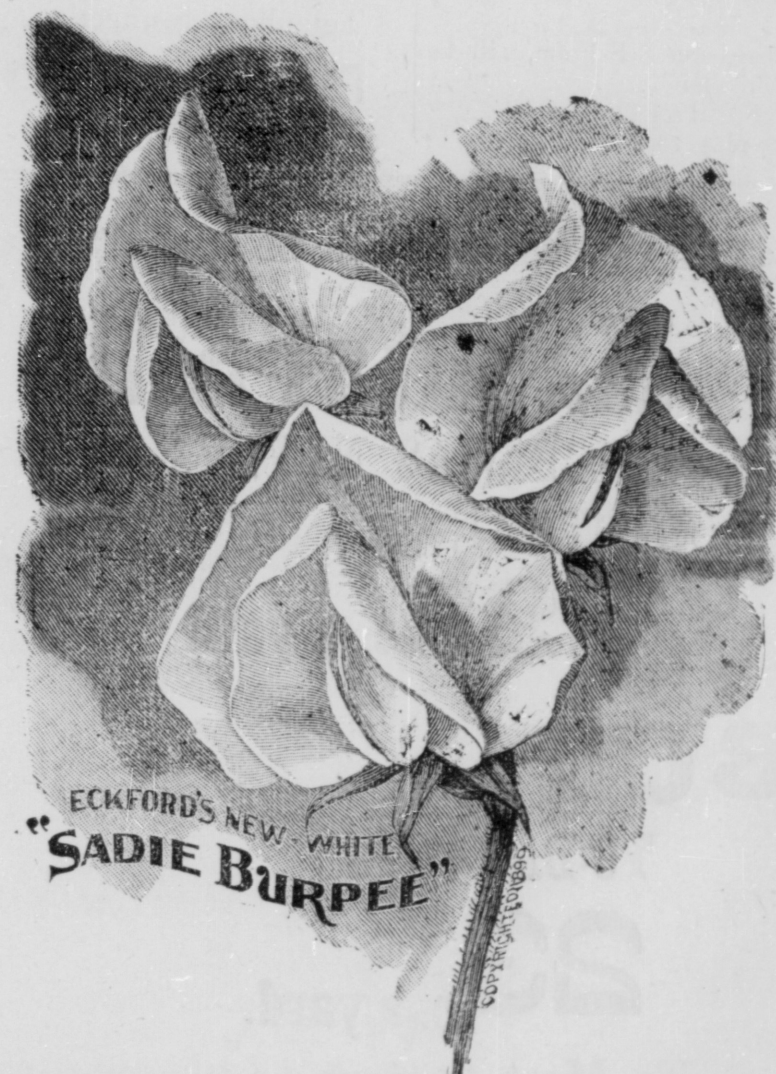
ECKFORD'S NEW WHITE "SADIE BURPEE"

Our giant Sweet Peas are all of the grandiflora type, over fifty varieties shown. Have taken prizes wherever shown. See our catalogue for Sweet Pea Competition for 1900.