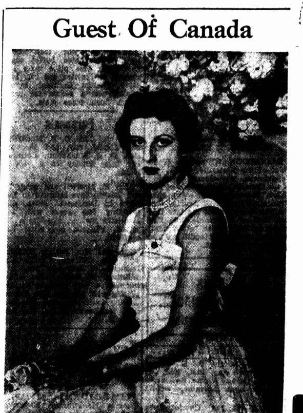
This special portrait of Princess Alexandra, daughter of the Duchess of Kent, was made by Cecil Beaton for her visit to Canada. She is wearing a white embroidered muslin evening dress.

engagements today, including a meeting with Premier Duplessis at the Quebec legislative buildings and a visit to the new Quebec veterans hospital at nearby Ste. Foy.