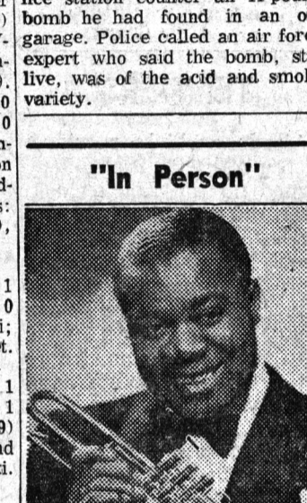
LOUIS ARMSTRONG and his All-Stars "The Greatest Musical Show that ever hit P. E. I." at the SPORTS ARENA July 24th at 9:00 p.m.

Tickets on Sale at In Charlottetown: Tweel's Restaurant; Men's: Hughes Drug Store and any Lions Club member. In Summerside: R.C.A.F. Groceries; Boates Pharmacy and CJRW. Sponsored by Ch'town Lions Club