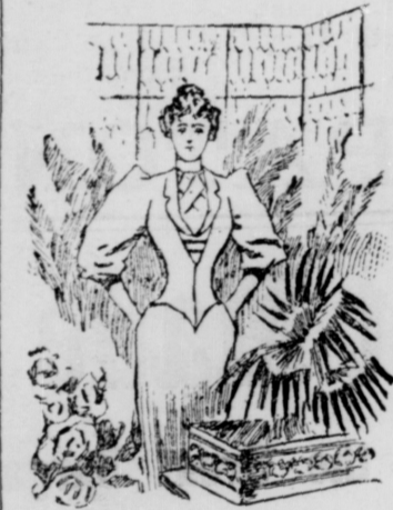
THE ASCOT COMPLETE. And, above all things, if you wear a tie which was originally intended to surround the immaculate collars of a larger growth, first make it fit your own 12 1/2 by cutting out a piece in the back and then learn how to tie it in the way it was intended to go.

The Ascot, by the way, has another point to recommend it. It will often save the wearer its price by the difference it will make in laundry bills.