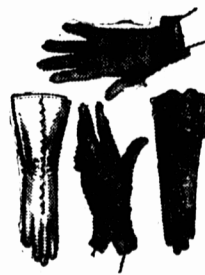
Table cut Gloves in a number of enchanting colors. Cabrakid and durable goatskin made up in dress or tailored styles. Sizes are 6 1/4 to 7 1/2. Holman Priced for Gifting.

Dressy! Durable! Delightful! Gift GLOVES ... in a wide selection 4.98