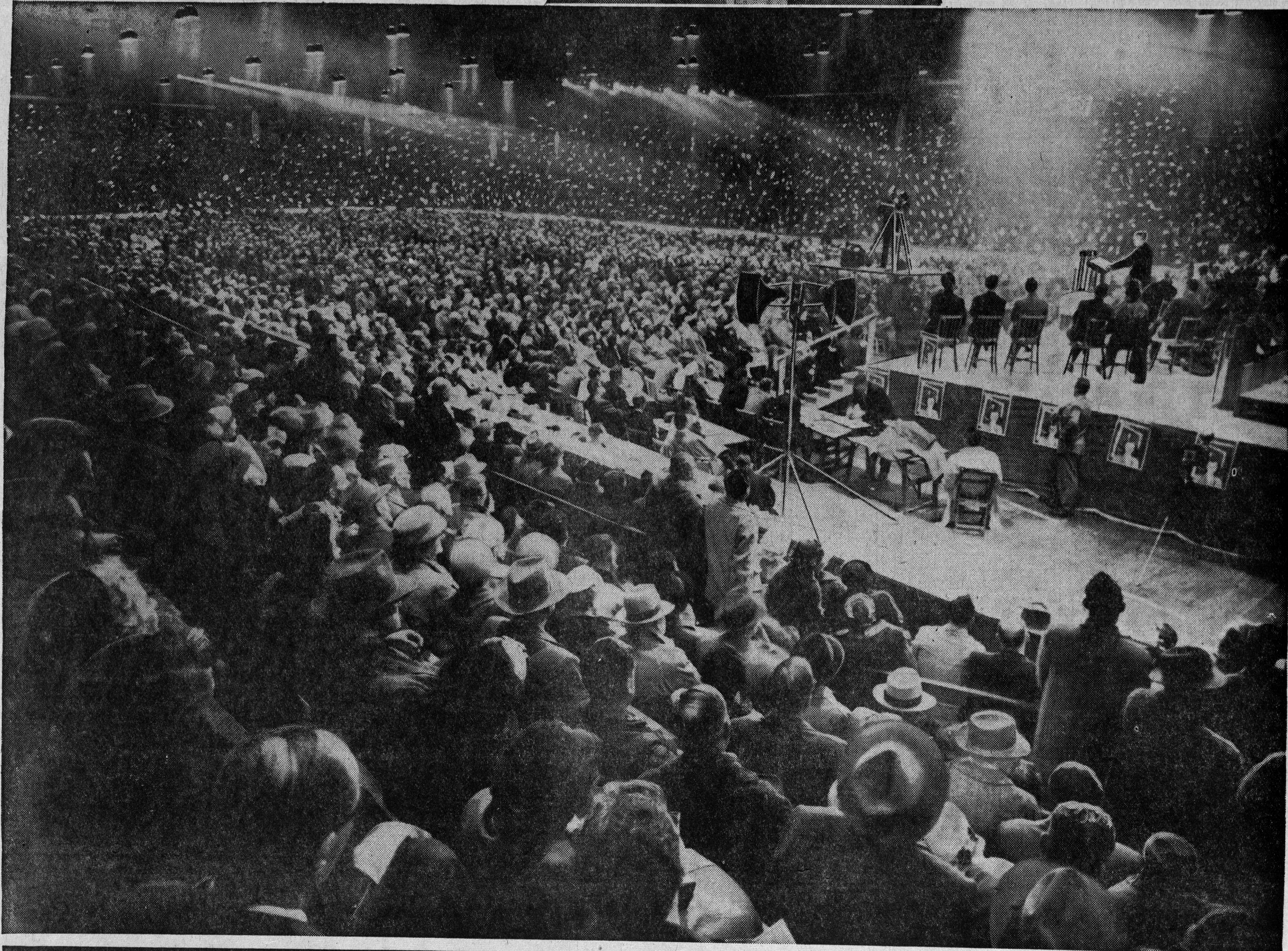
The Prime Minister addresses 10,000 in Vancouver

We believe your response to this great challenge will be a vote of confidence in the leadership of Prime Minister John Diefenbaker—a mandate to his Conservative Government to carry on—and a re-affirmation of your faith in this Greater Canadianism.