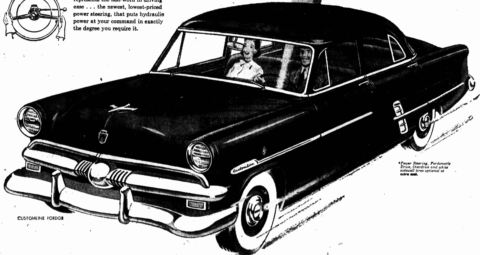
*Power Steering, Fordomatic Drive, Overdrive and white sidewall tires optional at extra cost.

Master-Guide Power Steering represents the last word in driving ease... the newest, lowest-priced power steering, that puts hydraulic power at your command in exactly the degree you require it.