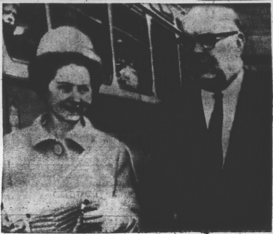
DIPLOMAT AND FIANCEE