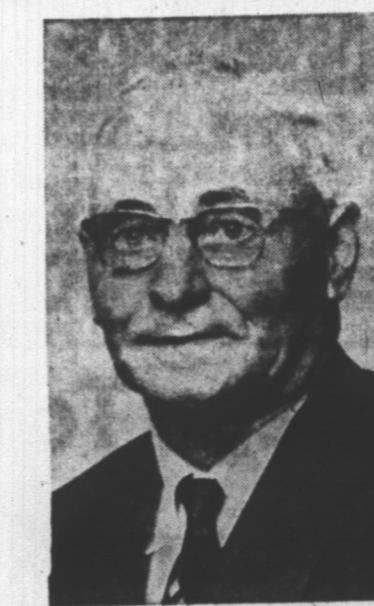
4th Kings Ewart Keeping