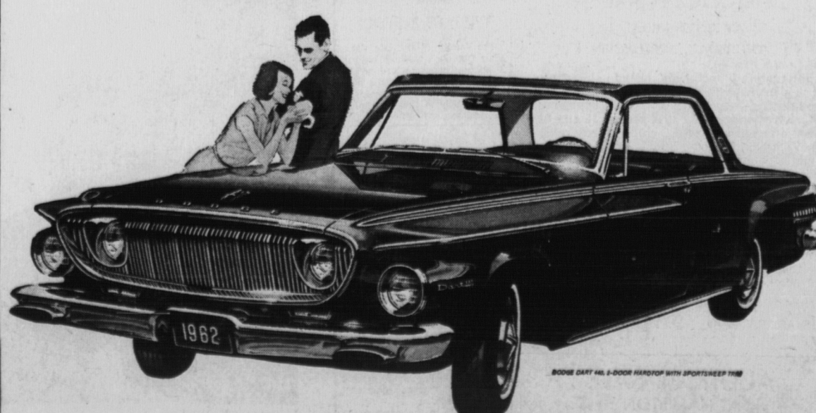
DODGE DART 440 HARDTOP WITH SPORTSWEEP TRIM

It's this way. You're about ready to go out and get yourself a new car. Chances are you've pretty well already settled on what make. What we say, is think it over. Find out what it's like to own a car that's just a little bit different, a little racier, just a dash more elegant than the one you've got in mind. Find out what it's like to drive a car with real zip under the hood, with a six, for instance, that fools everybody into thinking it's an eight. Find out that cars aren't all more or less the same. There's one around that outclasses the others by a mile. Its name is Dodge. So think again. Think fresh. Think Dodge. Visit your Dodge Dealer. And get set to get a new slant on your car for '62.