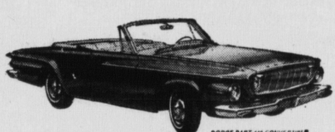
DODGE DART 440 CONVERTIBLE WITH SPORTSWEEP TRIM

THINK FRESH! THINK DODGE! GET A NEW SLANT ON CARS