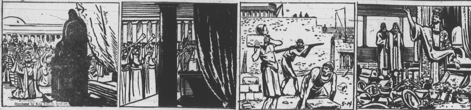
With Athaliah dead, queen Athaliah usurps the throne of Judah, restores Baal-worship and kills all her grandchildren but Joash who is saved by Jehoiada.—II Chronicles 22.