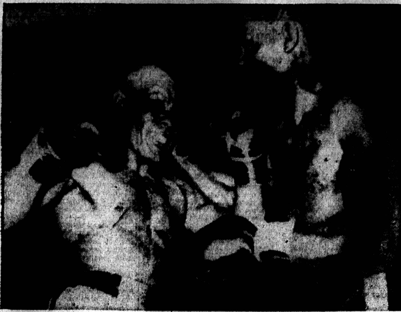
It looks like Eszard Charles has tickled Joe Walcott's left ear with his right hand swing in this 13th round exchange in their 15-round

battle in Detroit. And it's hard to tell whether Walcott is grinning or in slight pain. Charles retained his title by a close decision, though