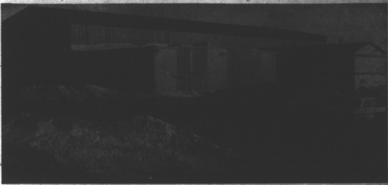
BATHURST MARINE'S GEORGETOWN SLIP BUILDING

RED CROSS MAKES OFFER GENEVA (Reuters)—The International Committee of the Red Cross announced Wednesday it has offered to help North Vietnamese victims of recent air attacks by U.S. and South Vietnamese aircraft. A spokesman said the international body made the offer "some days ago." He could not say whether the North Viet Nam-Red Cross had replied. EDITOR GETS AWARD LONDON (CP)—Denis Hamilton, 46-year-old editor of the Sunday Times, has received the 1964 Hanner Swaffer award as Journalist of the Year. The award to Hamilton was for making the Sunday Times, owned by Canadian-born Lord Thomson, "one of the great newspapers of the world." Hamilton received a prize of £500 and a gold spill pen.