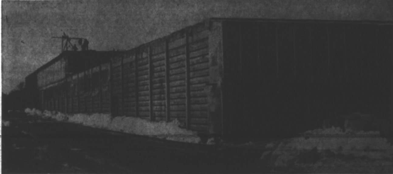
GULF GARDEN FOOD PROCESSING PLANT TAKES SHAPE