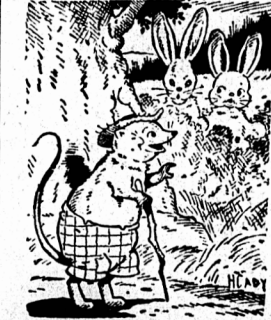
"Yo don't know what yo' are missing, Brer Rabbit."

West's defense it must be admitted that dummy's heart suit did not look very menacing! However, there was danger in that direction, judging by the bidding; and since East had called for a shift by playing his lowest spade, West should have shifted to diamonds. South could not get a discard on dummy's diamond suit, but he might, conceivably, in hearts, so the thing to do was to take out that lone entry to dummy!