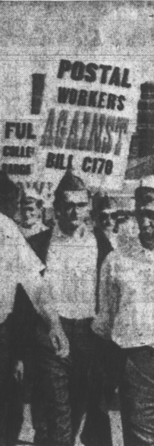
THEY WHISTLE WHILE THEY WALK

Greta was 300 miles northeast of San Fran, Puerto Rico, and 1,200 miles east-southeast of Miami Monday, moving northwest at eight miles an hour.