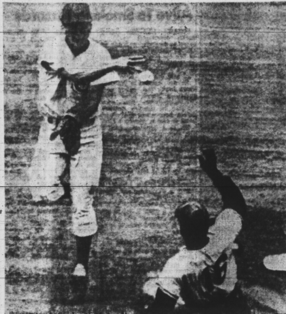
AWAY WE GO FOR TWO

the first mares the night pick Missy and Audrey's Pride paid 18.80 with most of the bettors whose tickets were alive after the first making the right pick. Peer's Model and C.N. Adios finished 1-2 in the third to pay $6.00 in the Quintella. Ozark Pete turned up in another fair pay in the second double as the combination of him and Miss Coppertone paid $8.00. The exactor combination of Topway and the Sheik paid $7.80 in the sixth race after the two entries had finished six and five the first time out in the second.