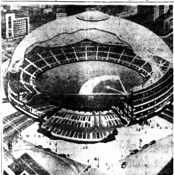
BROOKS FUTURE HOME

The Charlottetown Guardian, Friday, July 6, 1956