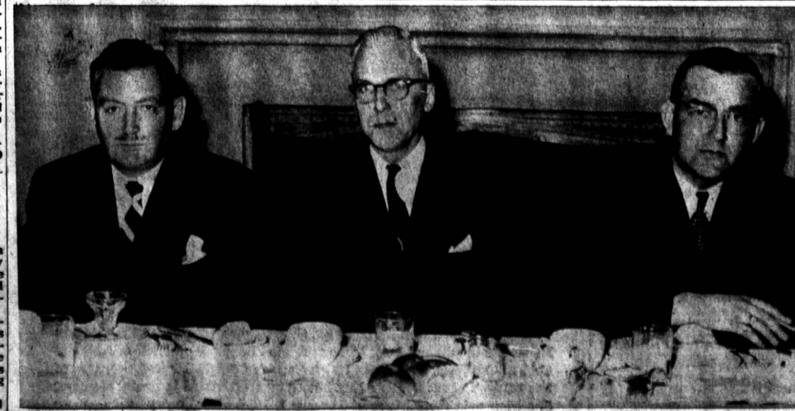
BOARD OF TRADE HOSTS TO CITY COUNCIL

MONTREAL (CP)—The Canadian National Railways System Wednesday reported net February operating income of $2,819,000, compared with a loss of more than $1,700,000 in the same period a year ago.