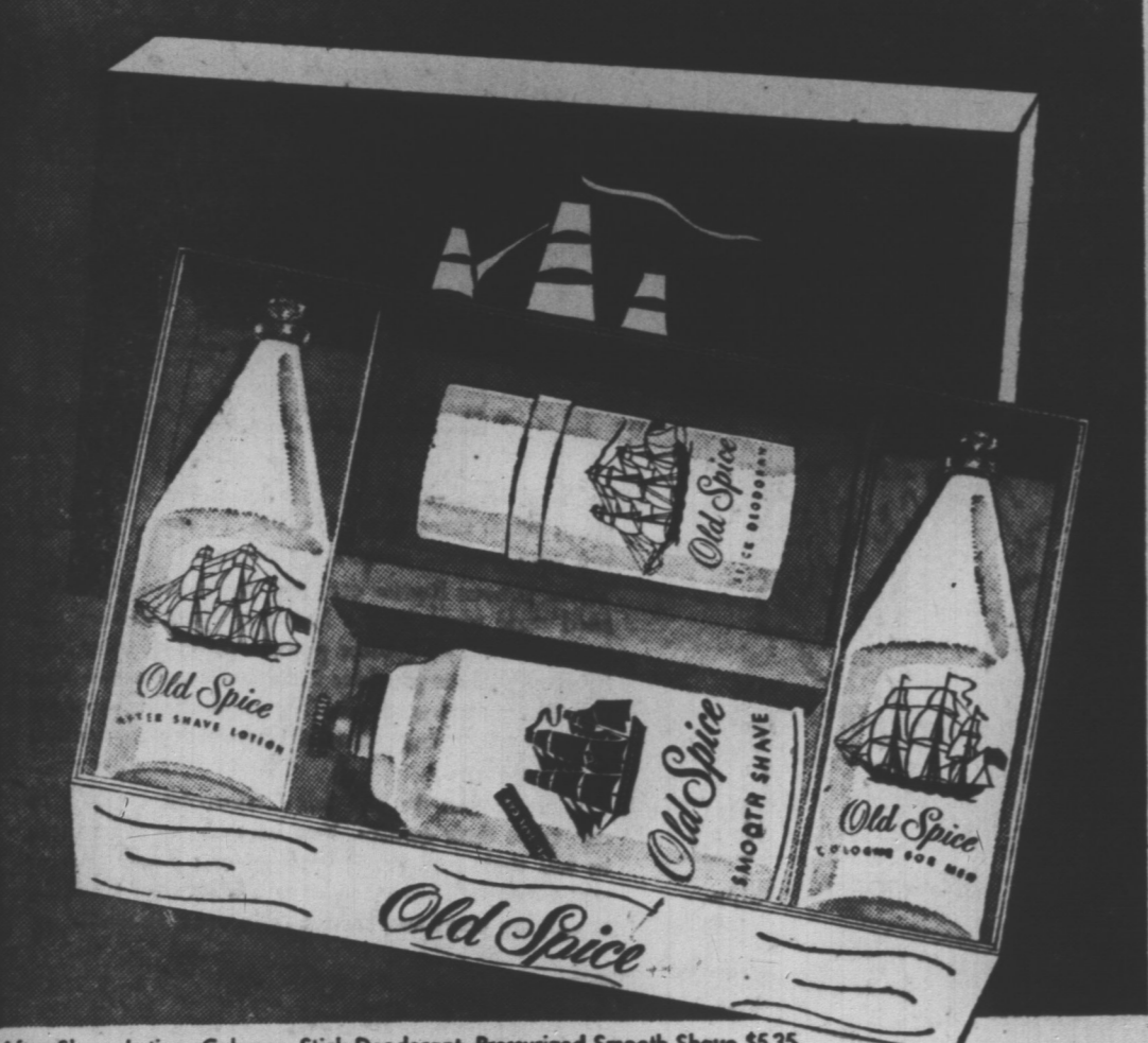
After Shave Lotion, Cologne, Stick Deodorant, Pressurized Smooth Shave $5.35

Give Old Spice THE FINEST GROOMING AIDS A MAN CAN USE!