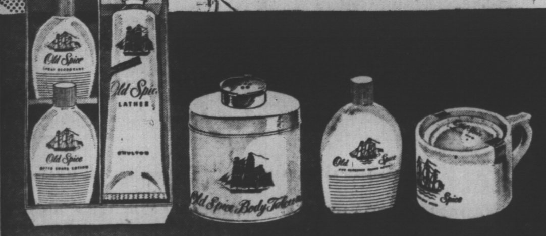
Lather Shave Cream, Plastic containers of After Shave Lotion and Spray Deodorant $2.25 Body Talcum $1.25 Pre-Electric Shave Lotion $1.25 Shaving Mug $1.50

Give Old Spice THE FINEST GROOMING AIDS A MAN CAN USE!