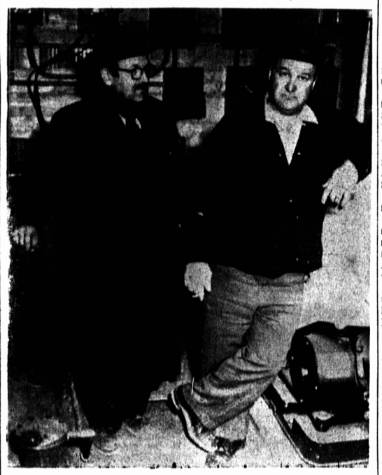
Plant Owner And Manager