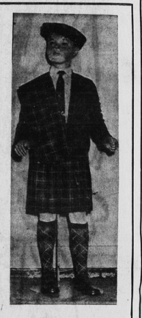
This little fellow is proudly wearing a few of the items available in our Island tartan. You'll find Island tartan items for every member of the family at Moore & McLeod Ltd.

Wedgwood China—Entire stock clearing 25% off regular prices. Maple Tree Craft by Leavitt's of Alberton. ● CANDLES/TICKS ● LAZY SUSANS ● PLATES ● CANDY BOWLS ● WALL PLAQUES ● ETC.