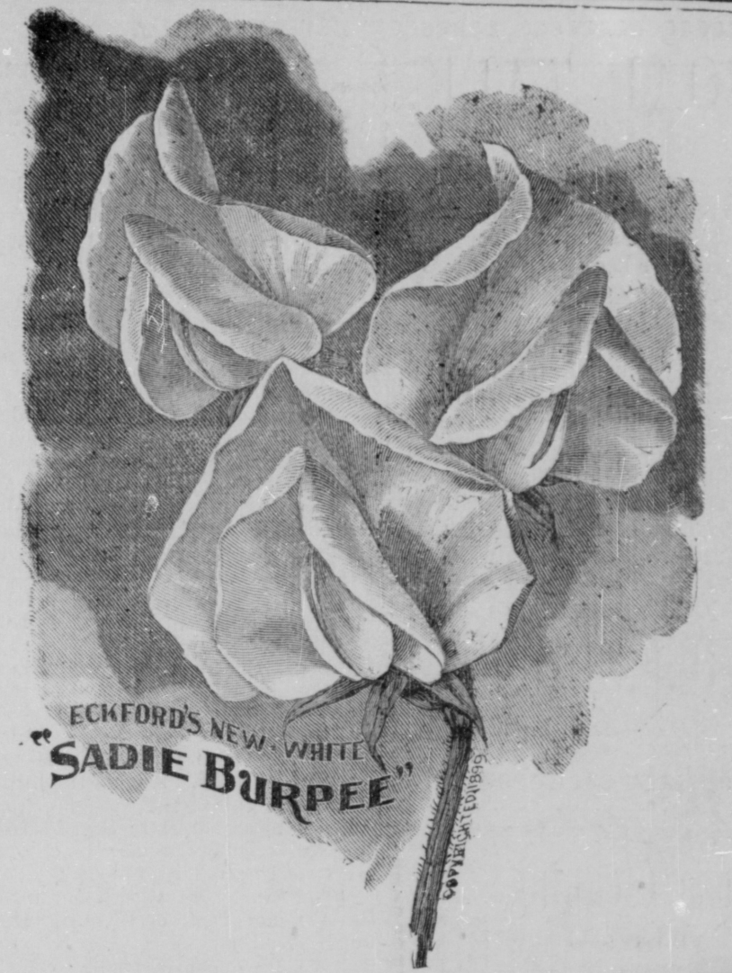
ECKFORD'S NEW WHITE "SADIE BURPEE"

Our giant Sweet Peas are all of the grandiflora type, over fifty varieties to choose from, have taken prizes wherever shown. See our catalogue for Sweet Pea Competition for 1900.