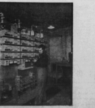
Microwave Radio Repeater Equipment at Hazel Grove, P.E.I.

This means that with the recent cut over of new Long Distance Dialing equipment in Charlottetown and Summerside it is now possible for a telephone user in Los Angeles, Vancouver, Toronto and many other centres in North America to dial telephones in Prince Edward Island direct without the assistance of an operator.