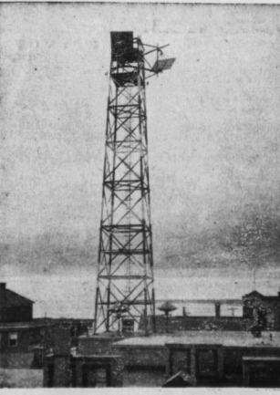
Microwave Radio Tower on Summerside Telephone Building