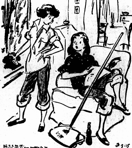
"He knows he should ask me a week ahead for a party. It takes that long to talk Dad out of a new dress."