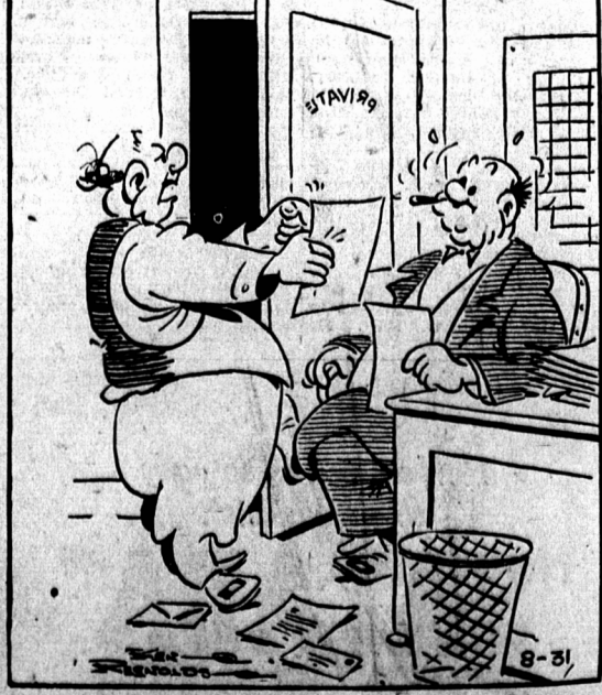
"This secretary should be capable—her answer to our Guardian Want Ad is sealed with a kiss!"