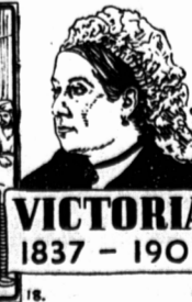
VICTORIA 1837 - 1901

WHEN VICTORIA CAME TO THE THRONE, SHE WAS YOUNG AND INEXPERIENCED, AND WAS HELPED BY THE TACT AND SYMPATHY OF LORD MELBOURNE. IN 1840 SHE MARRIED HER COUSIN ALBERT. IN THE CRIMEAN WAR, FLORENCE NIGHTINGALE WAS SENT OUT TO CARE FOR THE SICK AND WOUNDED. SHE EFFECTED A REVOLUTION IN NURSING AND SAVED COUNTLESS LIVES.