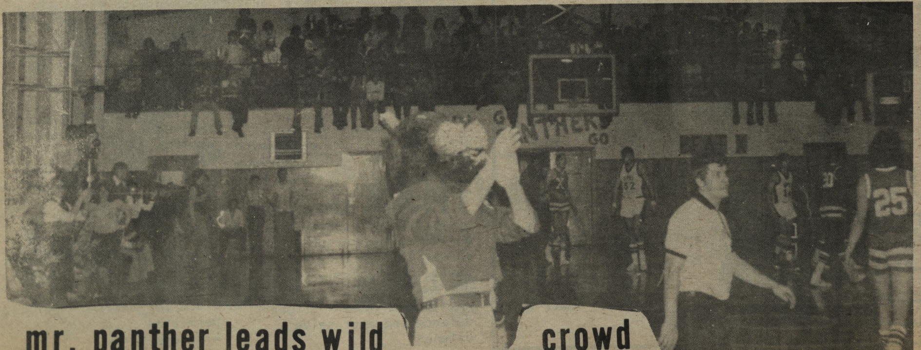
mr. panther leads wild

1 & 3 p.m. : Basketball UPEI vs. Dal. Interfaith service Movies (TBA)