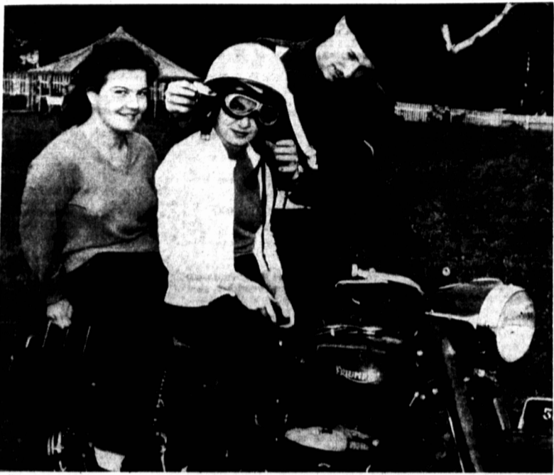
TWO ISLAND girls try out one of the Provost detachment's motor bikes during Army Day held at Charlottetown's Victoria compound Saturday afternoon.