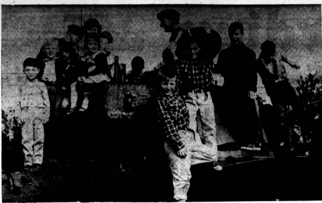
THE BIG Sherman tank displayed by the P.E.I. (17th Recce) Regiment attracted throngs of children all afternoon during the Army Day exhibition staged by...

LOS ANGELES (AP) — Detectives say a 37-year-old Negro houseboy has sobbingly admitted the strangulation of a silent movie heroine with this troubled reflection: "I've seen her face on every wall."