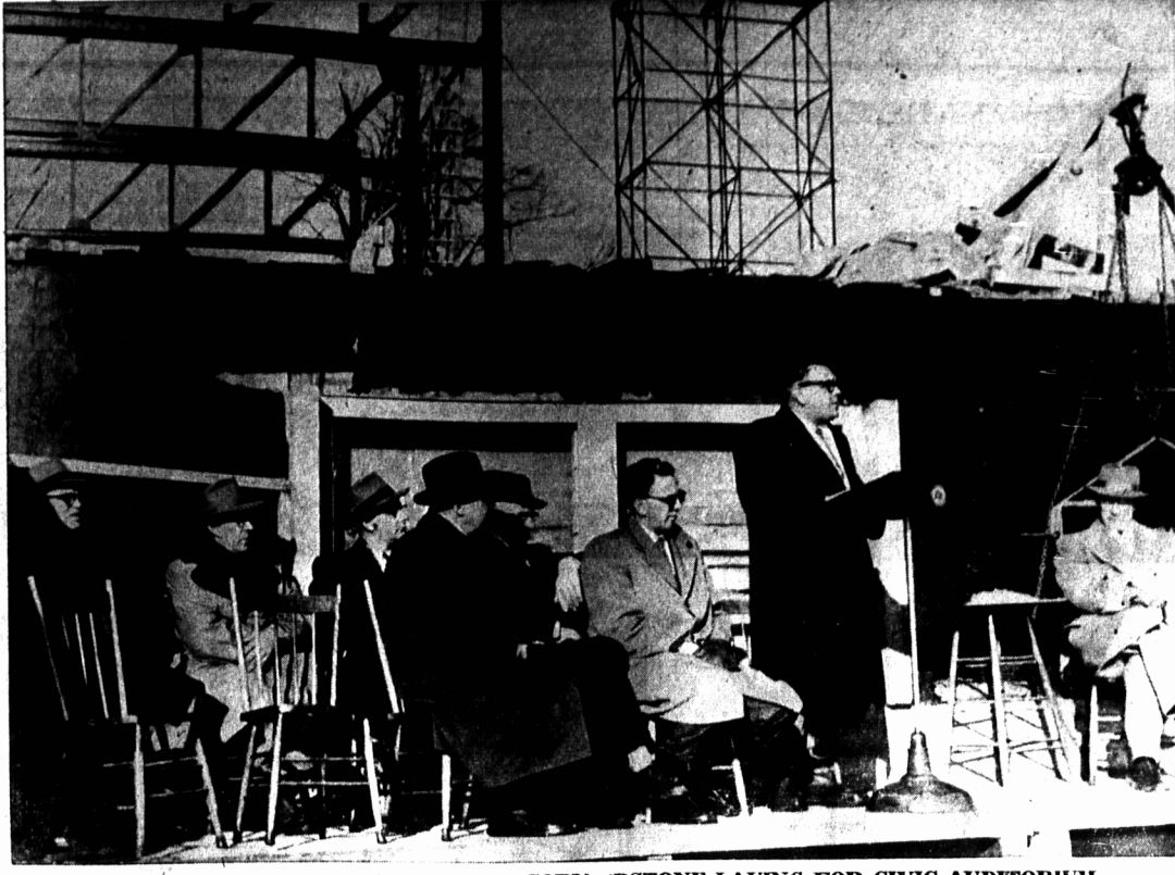
SUMMERSIDE MAYOR AND COUNCIL AT CORNERSTONE LAYING FOR CIVIC AUDITORIUM