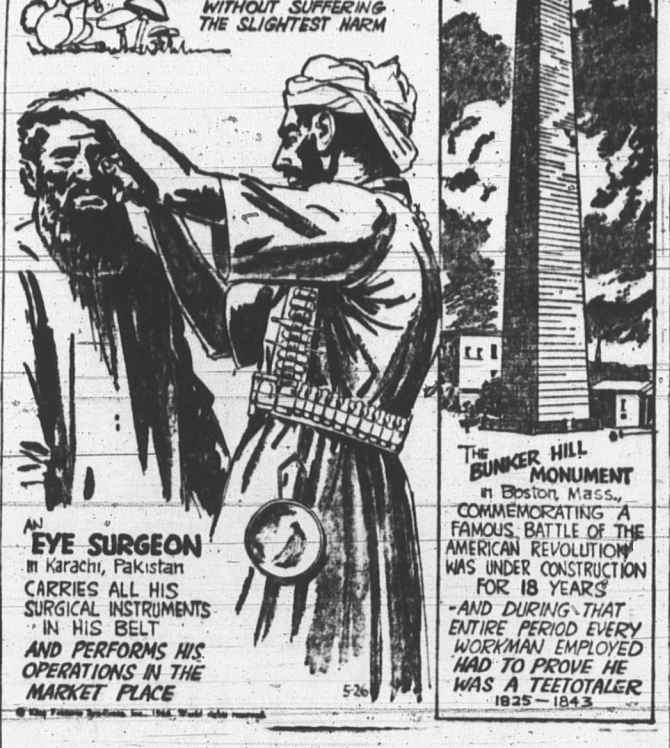
THE BUNKER HILL MONUMENT in Boston, Mass., commemorating a famous battle of the American Revolution was under construction for 18 years'—AND DURING THAT ENTIRE PERIOD EVERY WORKMAN EMPLOYED HAD TO PROVE HE WAS A TETOTALER 1825-1843

RABBITS CAN EAT THE DEATH CUP; TOMATOES CONTAINING POISON IN NATURE WITHOUT SUFFERING THE SLIGHTEST HARM