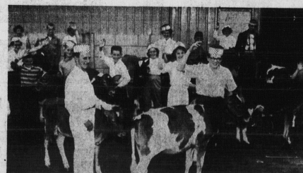
Eastern Canada's Largest Exhibit of Registered Livestock and Provincial Exhibition.