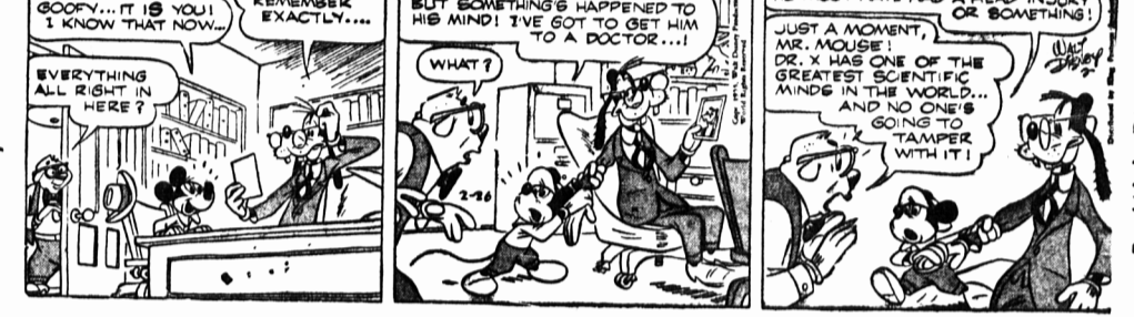
Mickey Mouse by Walt Disney