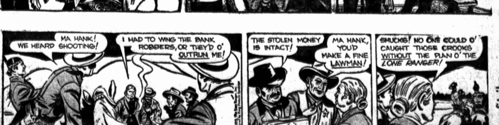
By Ham Fisher