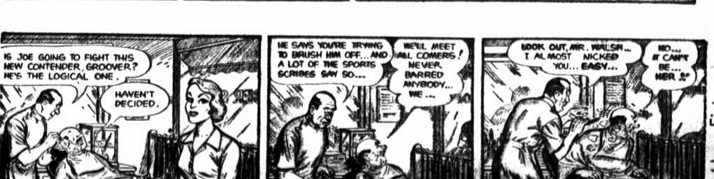
By Al Capp