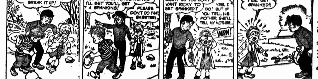
Mugs and Skeeter by Wally Bishop