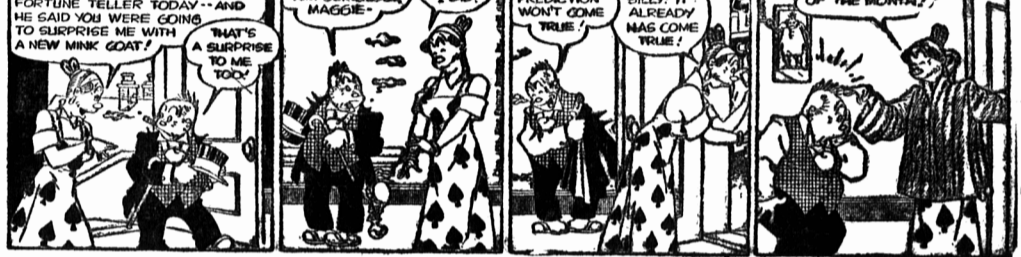
Bringin' Up Father by George McManus