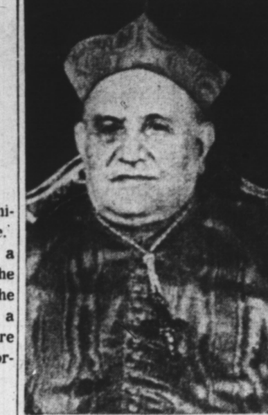
POPE JOHN Pope John Is 78 Today